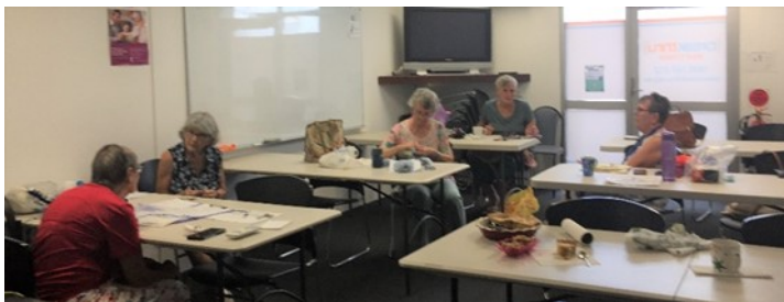
The craft group in class who believe that social interaction is an important part of their gatherings