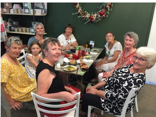
Pictured left Christmas coffee get-together