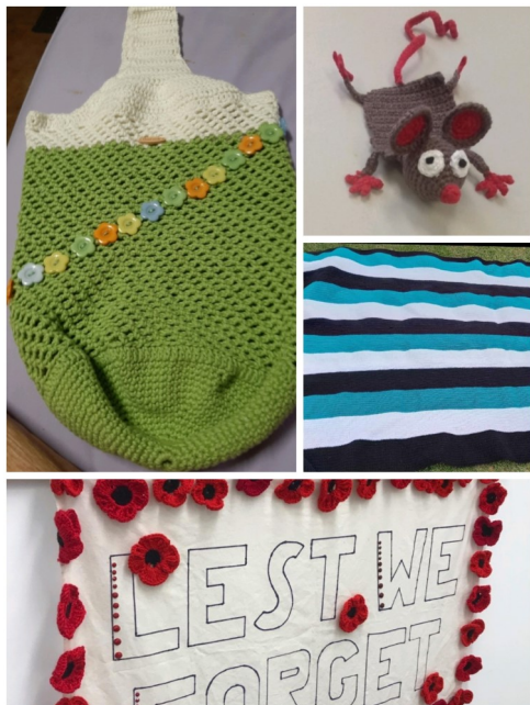
Pictured are some of the projects by the U3A craft group

The U3A Craft Group extends to all U3A members our very best wishes for the holiday season. Please have a wonderful Christmas and New Year and stay safe.