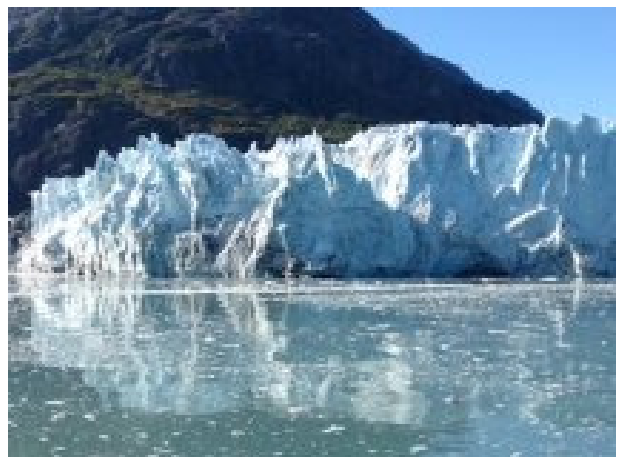
Glacier Bay, Alaska