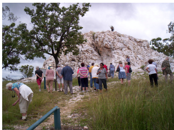
Wandering around and on top of the ancient Quartz Hillock