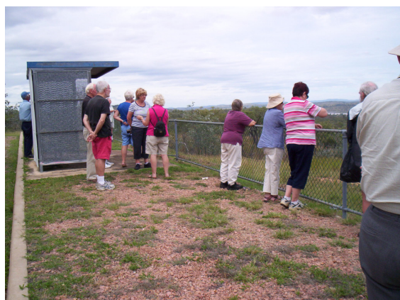
. Looking out over the Burdekin Dam's main body of water