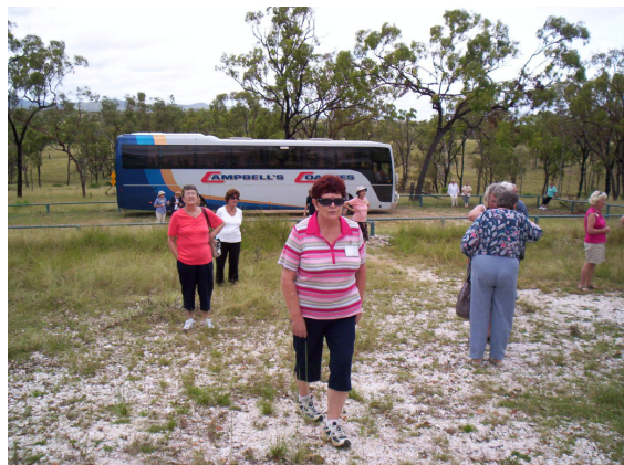
Off the coach to look at the White Blow