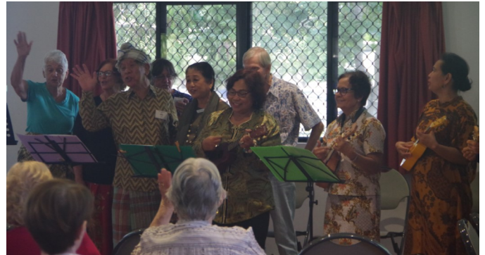
Indonesian Singers (above)

LUNCH AS USUAL WAS DELICIOUS WITH PLATES SUPPLIED BY MEMBERS.